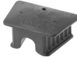
Mouth Gag "McKesson" L DM-1125-54 $