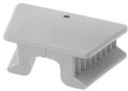
Mouth Gag "McKesson" XL DM-1125-52 $165.55