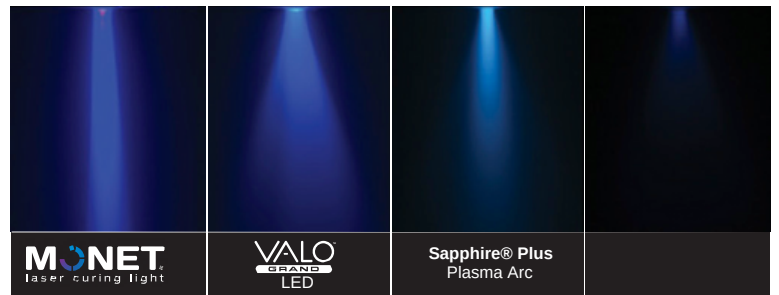
Products listed are trademark...

Laser curing provides a consistent dispersion of energy and intensity at any distance to create a complete, reliable, and even beam pattern. The collimated beam improves polymerization through composites. Each click is a one-second cure reaching through 2.5mm of composite depth, that means it's possible that bulk fills can be done in three seconds!