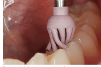
The brush bristles can be bent for easy access to fissures